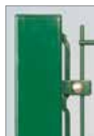
Fence connection strip