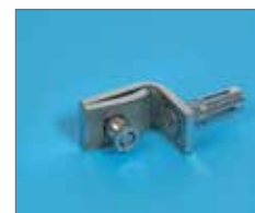
Fence connection clip